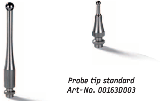
Probe tip standard Art-No. 00163D003